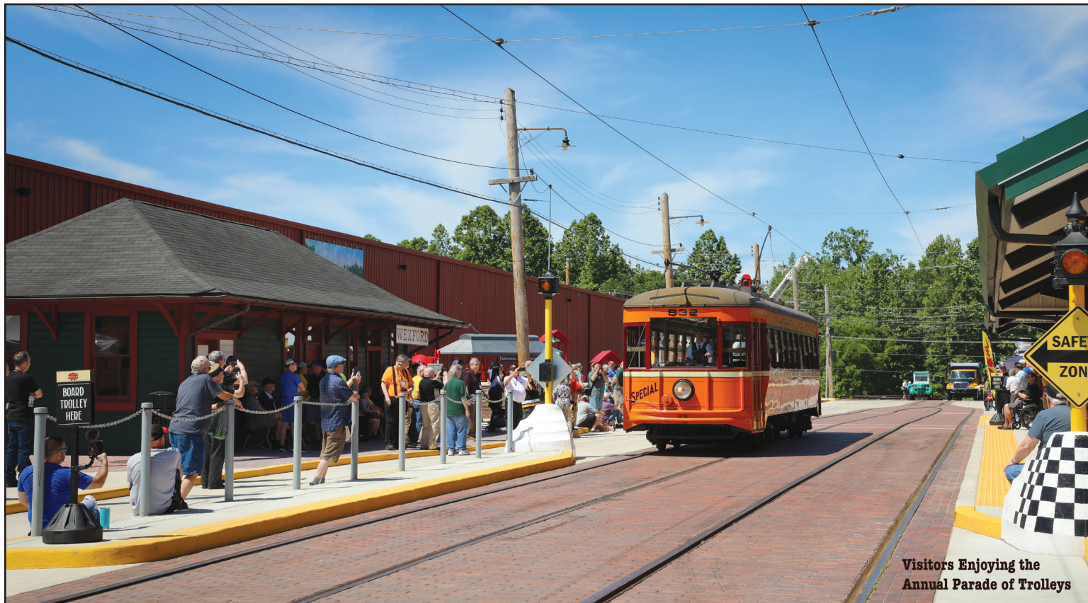
Visitors Enjoying the Annual Parade of Trolleys

Every day at the Pennsylvania Trolley Museum, visitors can ride on beautifully restored, antique streetcars that tell the story of the Trolley Era.