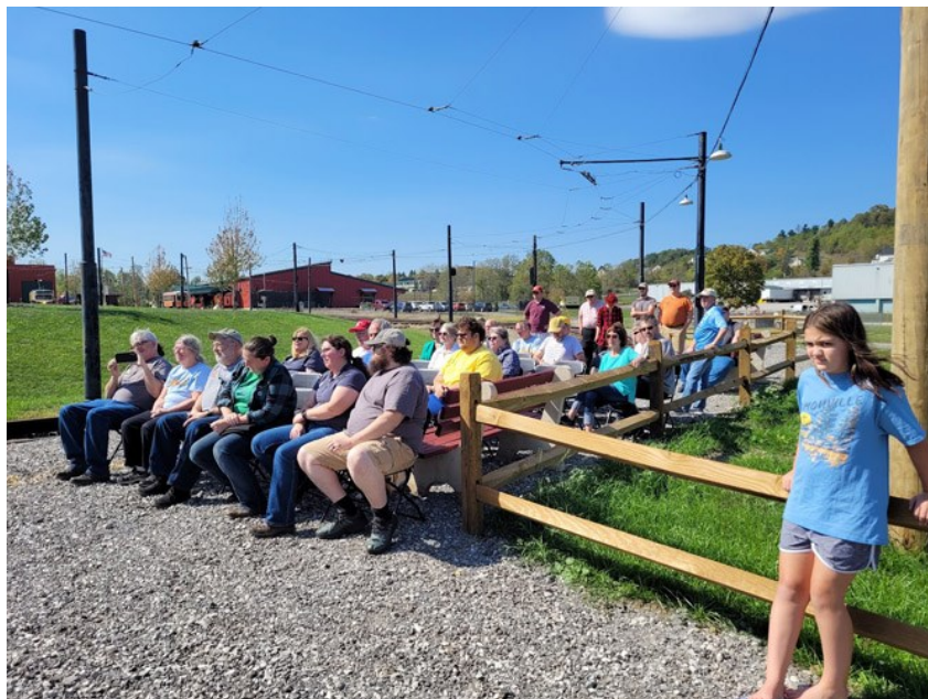
Crowd at Ellis Stop Dedication