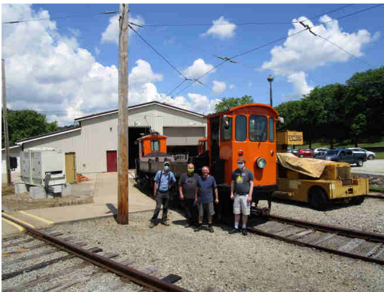
Shop volunteers pose with newly refurbished PAT Side Dump M551 6-20-20

I want to remind everyone about the Annual Membership Meeting to be held on Saturday, September 12 th . This will be a virtual meeting using Zoom. The main topic of this meeting is to have the nominating committee present their slate of candidates for the 2021 Board of Trustees election and to update you on our "On Track for the Future" capital campaign.