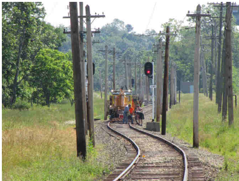
Way & Track volunteers replace ties 6-20-20

Please keep sending your stories. I have received many positive comments from our readers. dcramer@patrolley.org