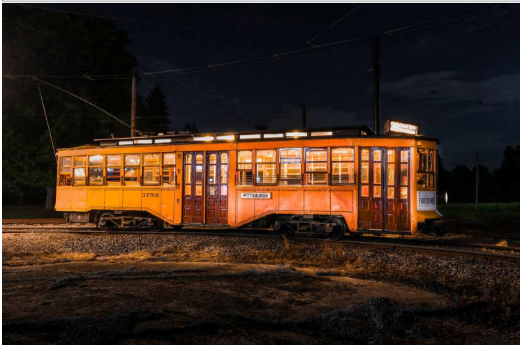
County Fair 2019

Crew Schedule Operating Policies & Procedures Operating Orders Operations Department Forms Log In Required