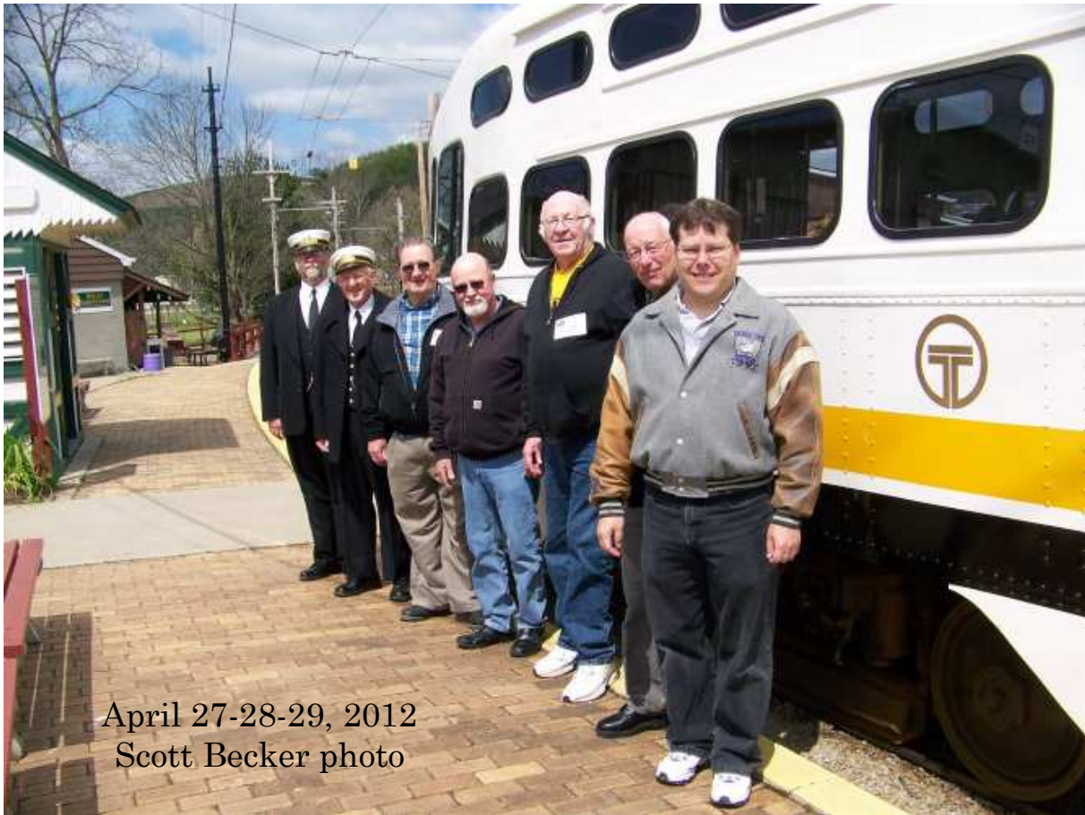
April 27-28-29, 2012